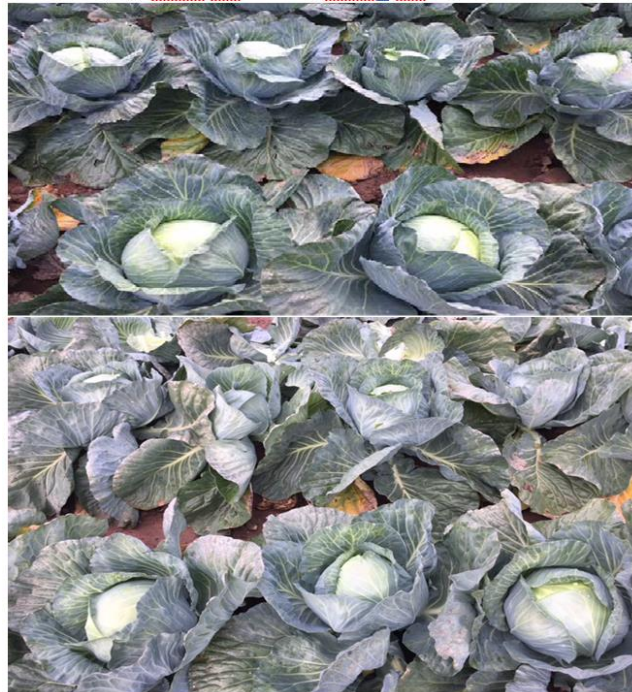
PICTURE 1: Top is the Fertiactyl GZ, bottom is Black Label Zn treatment.