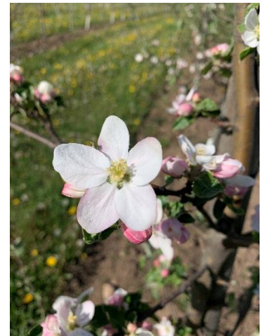
Flowers on trees in treated section