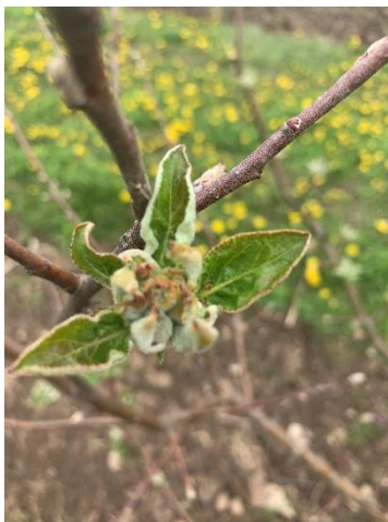
Frost damage in control section