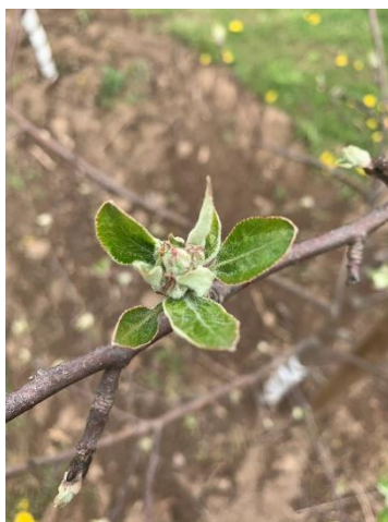
Tight clusters on trees in treated section