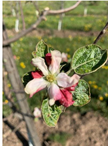
flowers on trees in control section