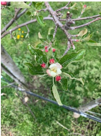
Frost damage in control section