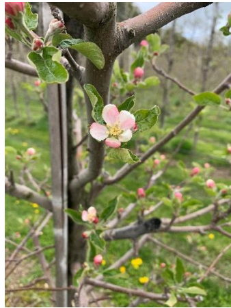
Bloom in treated section