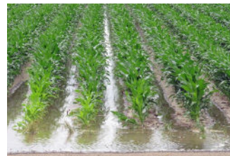
Excessive of Moisture