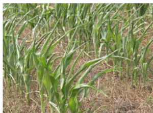
Lack of Moisture